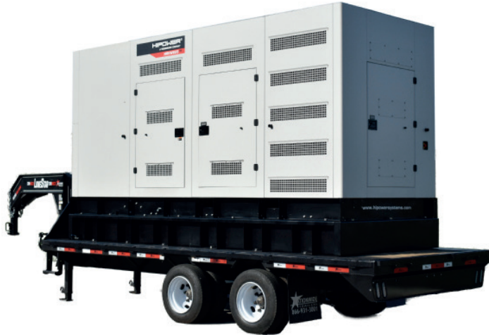
* Trailer is sold as option