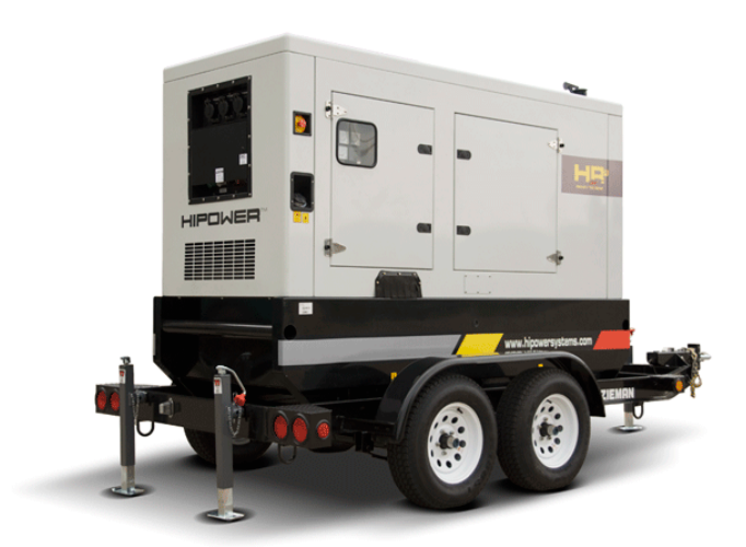
Photo depicts a typical model but may not include options such as trailer.