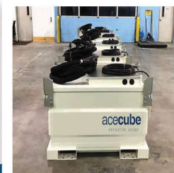
bi-directional forklift pockets for maximum manoeuvrability