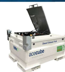
Heat trace hosing secured through the unique letter box openings.