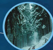
Cold weather kit