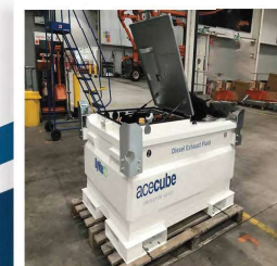
heat trace hosing available for cold weather applications