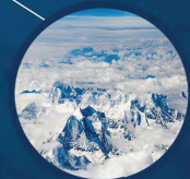
Extreme cold weather kit