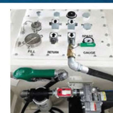
12V Electric Pump with Nozzle and 4M hose for Manual Dispensing.