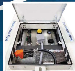
Monitoring equipment for Ad-blue / DEF Levels, Pump status, DEF Temperature