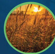
Standard warm weather kit

The Ad-Blue DEF cube is designed to meet the most extreme climate conditions for proper, Safe storage of Ad-Blue/DEF without freezing