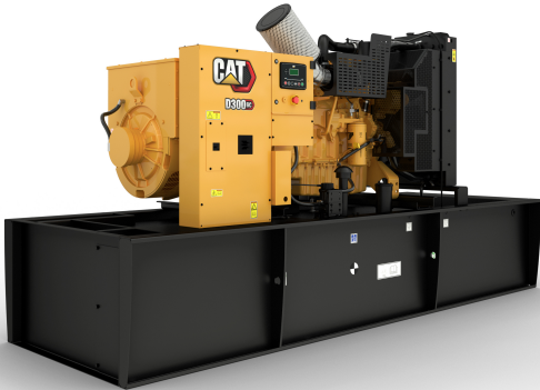
Image shown might not reflect actual configuration