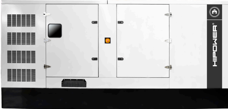
Generator depicted with sound attenuated option, some accessories for display only.