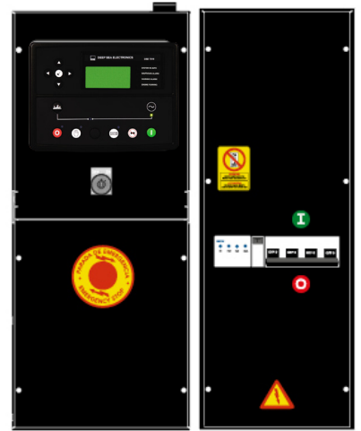
Pictures of Control Panel RH and Distribution Panel LH may include optional equipment and/or accessories

Alternator alarms included: Overload, unbalanced voltage, over voltage, under voltage, over frequency, under frequency, short circuit, reverse power, and incorrect phase sequence.