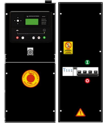
Pictures of Control Panel RH and Distribution Panel LH may include optional equipment and/or accessories

Alternator alarms included: Overload, unbalanced voltage, over voltage, under voltage, over frequency, under frequency, short circuit, reverse power, and incorrect phase sequence.