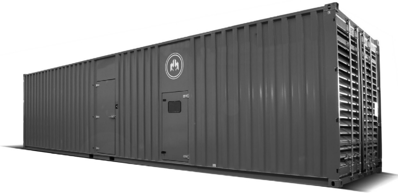
Generator depicted with sound attenuated option, some accessories for display only.