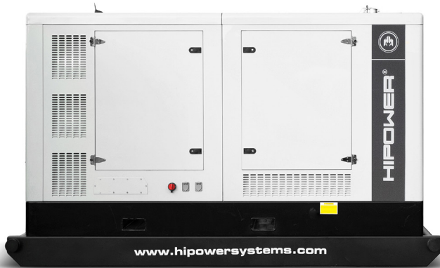
Photo depicts a typical model but may include optional accessories.