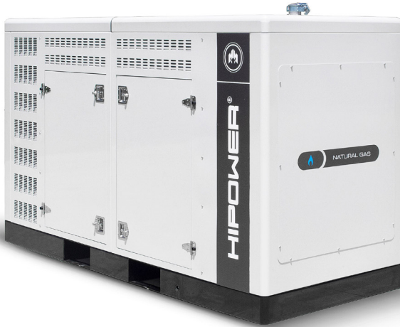
Photo depicts a typical model but may include optional accessories.