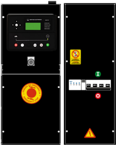
Pictures of Control Panel RH and Distribution Panel LH may include optional equipment and/or accessories

Alternator alarms included: Overload, unbalanced voltage, over voltage, under voltage, over frequency, under frequency, short circuit, reverse power, and incorrect phase sequence.