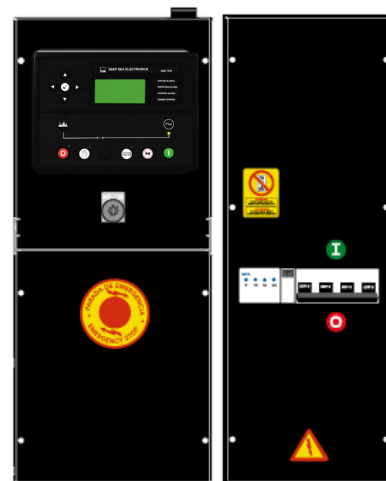
Pictures of Control Panel RH and Distribution Panel LH may include optional equipment and/or accessories