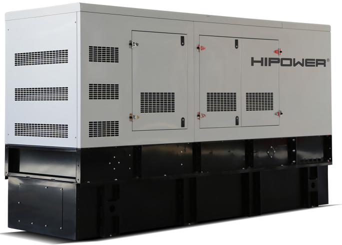
Generator depicted with sound attenuated option, some accessories for display only.