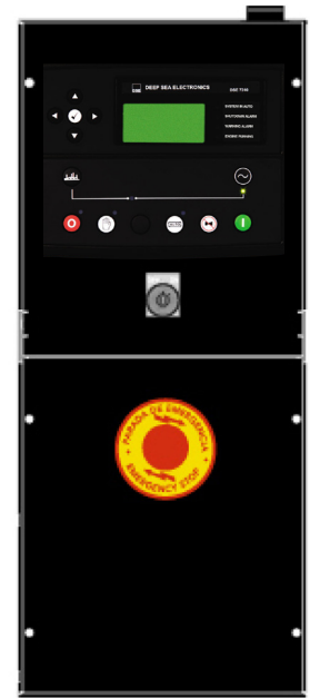
Pictures of Control Panel RH and Distribution Panel LH may include optional equipment and/or accessories

Alternator alarms included: Overload, unbalanced voltage, over voltage, under voltage, over frequency, under frequency, short circuit, reverse power, and incorrect phase sequence.