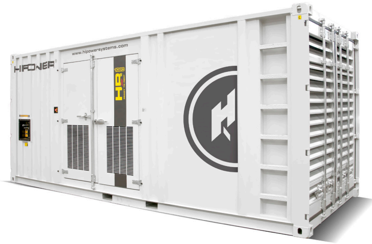
Generator depicted with sound attenuated option, some accessories for display only.