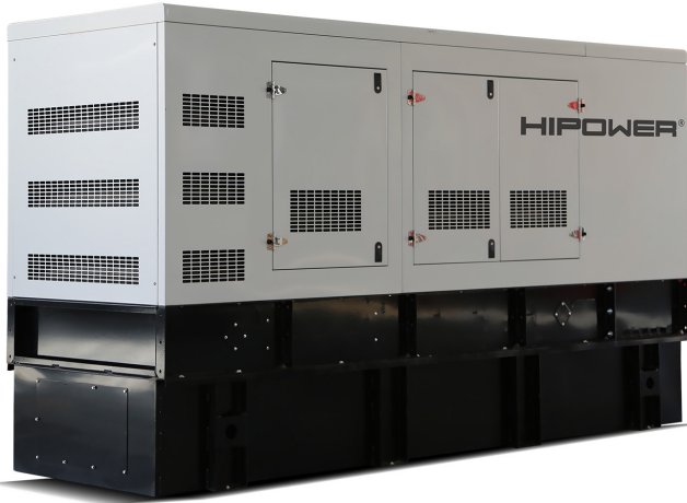
Generator depicted with sound attenuated option, some accessories for display only.