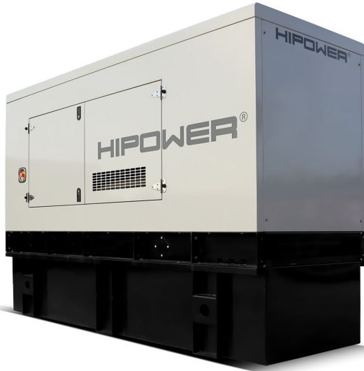
Generator depicted with sound attenuated option, some accessories for display only.