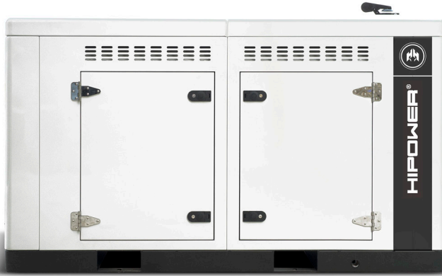
Photo depicts a typical model but may include optional accessories.